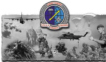
USAF Combat Control Association and Foundation